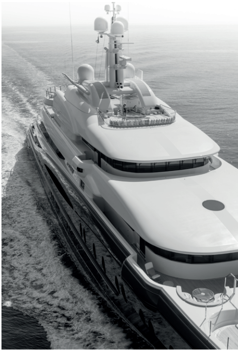
Using high-tech telematics, Oceanco can provide 24/7 support to yachts from headquarters.