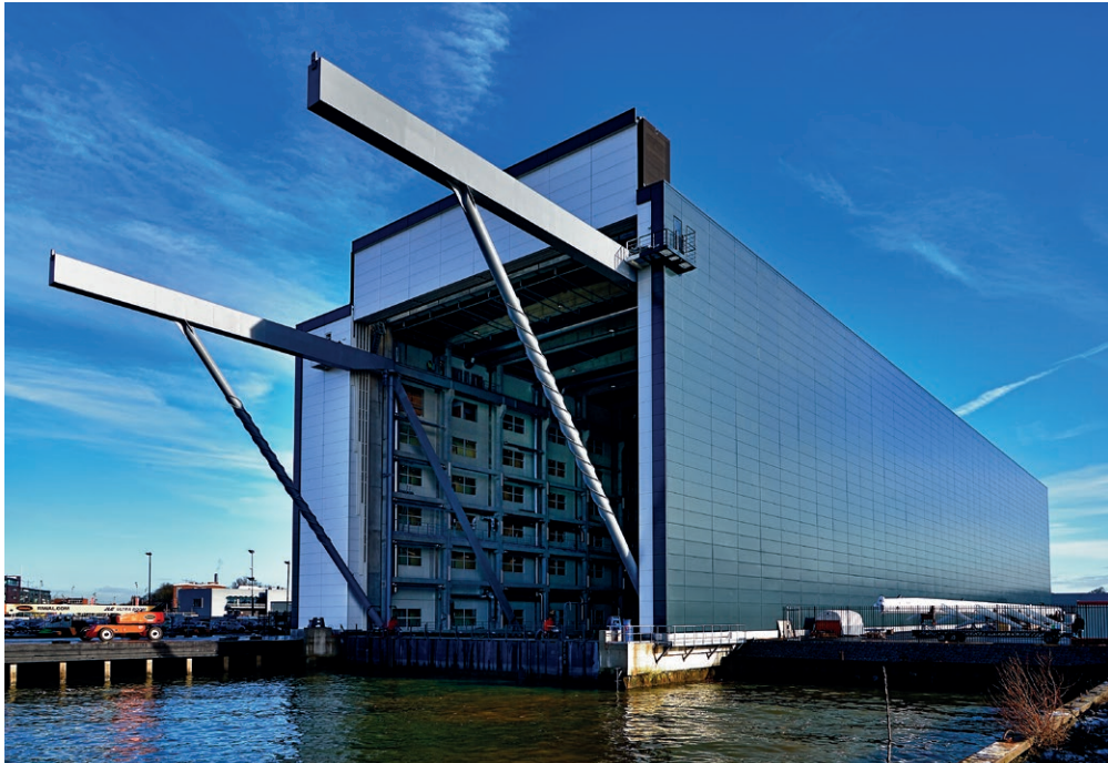
New climate-controlled shed with offices, operational in 2015 (33 meters tall, 152 metres long with dry dock of 10 metres deep).

the old shed and surrounding area. Then the first plans were made for expansion. “We negotiated successfully with the local council”, says marketing manager Paris Baloumis. “The municipality has been most positive and its well-organised infrastructure is attractive to entrepreneurs: regulations are transparent with good support and efficient communication channels. Inhabitants also warmly welcomed us. At the opening of our new yacht building shed in 2015, we welcomed some 4,000 people in just two days.” Oceanco involved all final-year pupils of Alblasserdam’s primary schools in creating a work of art to commemorate this highlight. Connecting with the youth is important to us. Consequently, we also sponsor a local events organisation. This enables us to give something back to the community”, says Swanink.